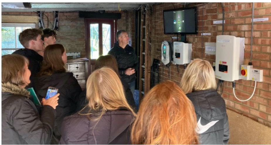
'The Changemaker event helped us understand that it's not just big cities that can make a difference, towns like Thame can too' Lord Williams Student

The COP26 Glasgow Pact represents a series of doors to the future, but what will entice leaders to go through those doors?..More words, more blah, blah blah is unlikely to help much. Instead we can catalyse actions, which speak louder than words. Thame COP26 is a brilliant example of that. Let's walk through our personal doors, form communities, help others to walk through doors locally and right up to the UK government and beyond.'