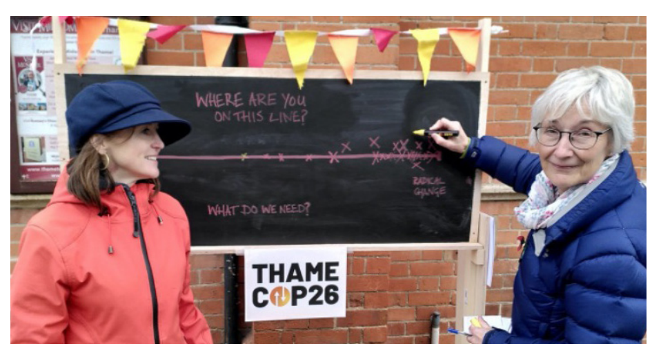
COP researchers asked "What do we need quiet evolution or radical change?"

GE People were often passionate and distressed, happy to approach us rather than us approaching them, so that they could add their voice to the conversation.